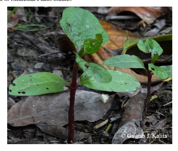
Fig 7: Basella alba