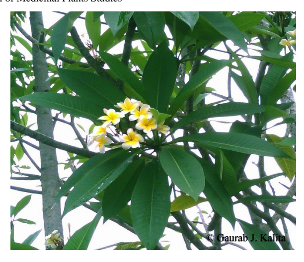
Fig 19: Plumeria rubra