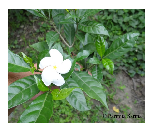
\textbf{Fig 16:}\ Taberna emontana\ coronaria