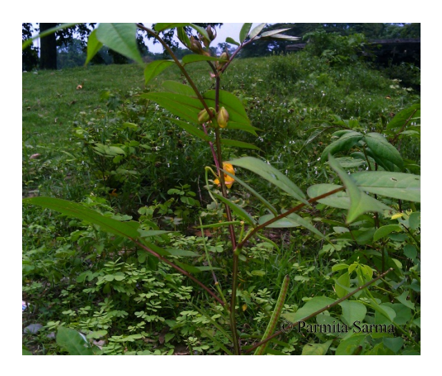
Fig 10: Cassia occidentalis