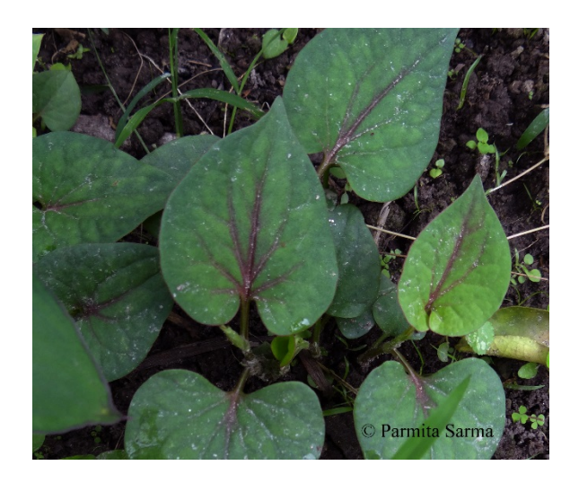
Fig 12: Houttuynia cordata