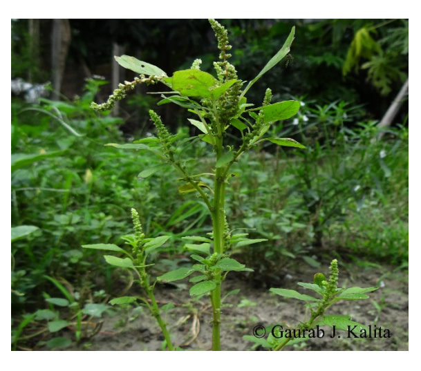
Fig 4: Amaranthus spinosus