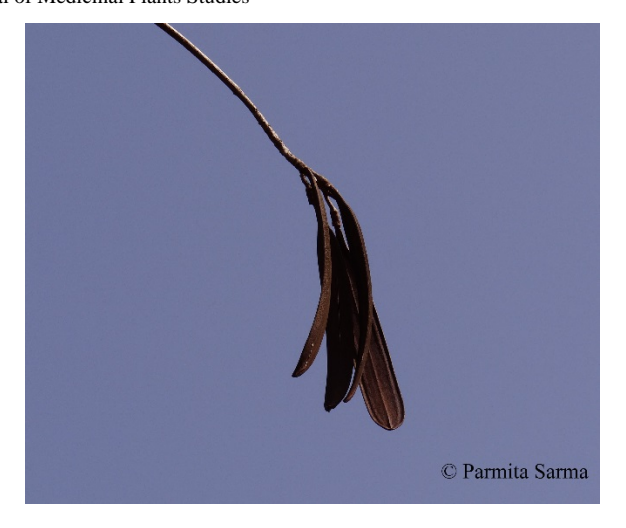
Fig 13: Oroxylum indicum