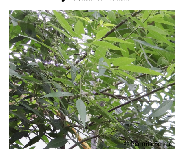
Fig 15: Vitex negundo