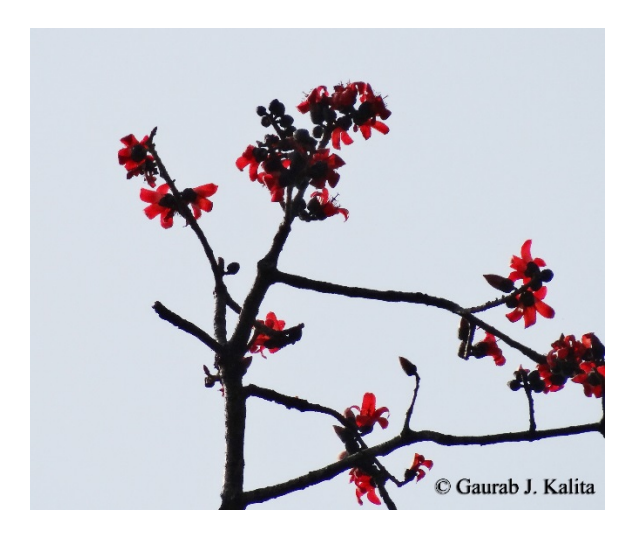
Fig 8: Bombax ceiba