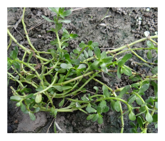
Fig 6: Bacopa monnieri