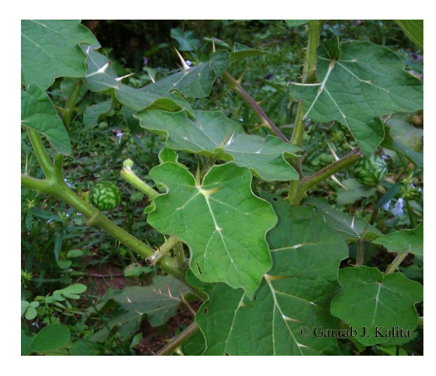
Fig 18: Solanum xanthocarpum