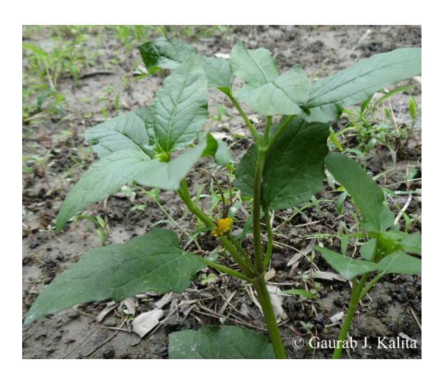
Fig 17: Spilanthes paniculata