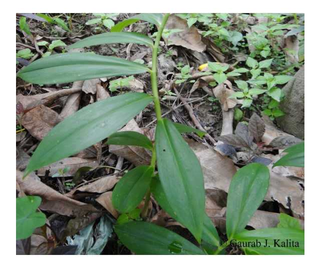
Fig 11: Costus specious