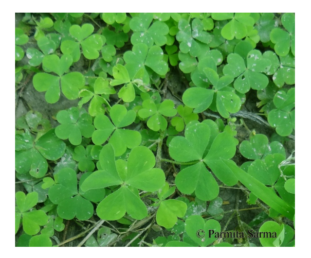
Fig 14: Oxalis corniculata