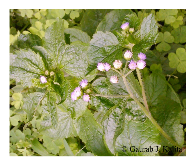
Fig 3: Ageratum conyzoides