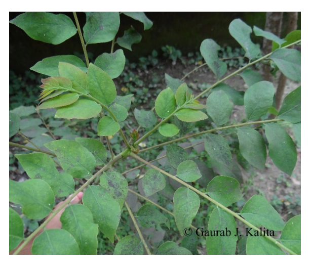
Fig 20: Phyllanthus acidus