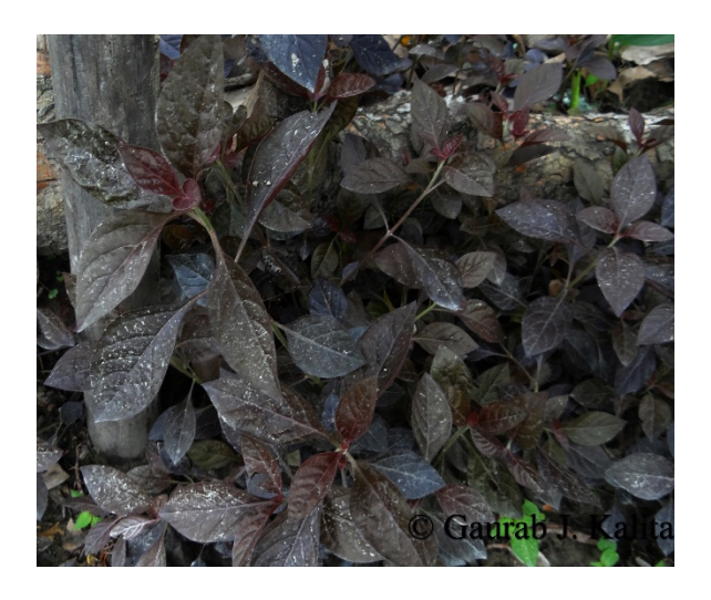
Fig 5: Amarantus bicolour