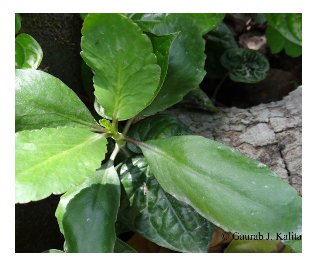
Fig 9: Bryophyllum calycinum