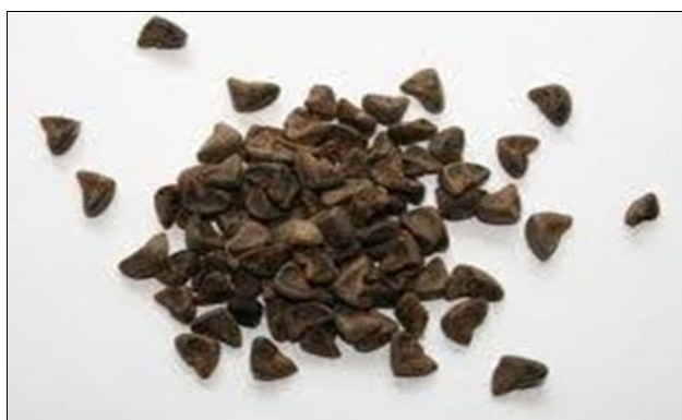
Fig 1: Seeds of kenaf plant (Salih, 2016) [60]

Alexopoulou et al. (2013) [4] exposed that post pollination capsules of seeds are made, which are 1.3 – 1.9 cm wide and 1.9 – 2.5 cm long. The seed grows in five – lobed capsules. Every capsule has five segments, and a total of 20 – 26bseeds capsules -1 . Small hairy structures surround the seed capsules, which causes irritating for human skin. The grown type's capsules are typically indehiscent and persist intact for numerous weeks once accomplish its maturity. Under normal conditions of storage, the seed is viable for around eight months. Generally, kenaf plant seeds are similar. Nevertheless, there are some color and size differences. Kenaf seeds are around 4 mm wide and 6 mm long, which are wedge-shaped and have black color as showed in (Fig 1) (Salih, 2016) [60]. While, Islam (2019) [32] who told that kenaf seeds are triangular, sharp angles, ash gray with pointed pale yellowish warty patches. Brown hilum color and are relatively small.